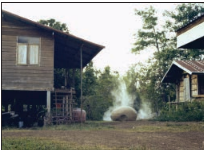
A Letter to Uncle Boonmee (2009) Apichatpong Weeraesethakul

Also in Gallery 2 the short film A Letter to Uncle Boonmee gives vital insight into the Primitive project. Originally intended for screening in cinemas, this piece traces Apichatpong's journey to find the enigmatic character 'Uncle Boonmee, A Man Who Can Recall His Past Lives', who provides the fundamental motivation behind Primitive . The accompanying short film Phantoms of Nabua can be viewed online at www.animateprojects.org/ .