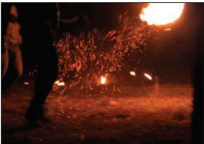
Phantoms of Nabua , (2009) Apichatpong Weeraesethakul