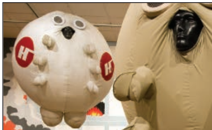
Halliburton SurvivaBalls The Yes Men

The sound before you make it is a sculptural flipbook in which miniature zombies are brought to life through the flashing of a strobe light. The work uses the technology of the zoetrope, a 19th Century optical toy, and re-contextualises it with Michael Jackson's Thriller music video. The figures are cursed to a circle of repetition as the piece loops relentlessly, like Jackson's image itself, preserved and immortalised through the constant play of his iconic records.