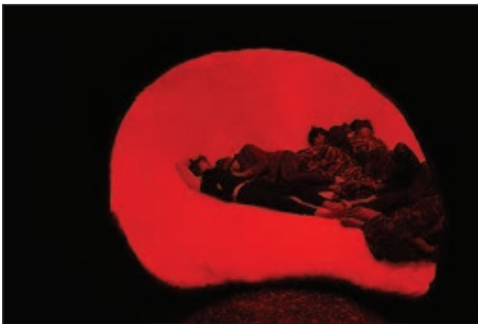
Primitive (2009) Apichatpong Weerasethakul