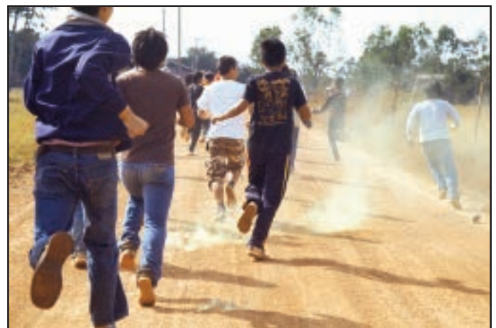
Primitive (I'm Still Breathing) , (2009) Apichatpong Weerasethakul and Modern Dog